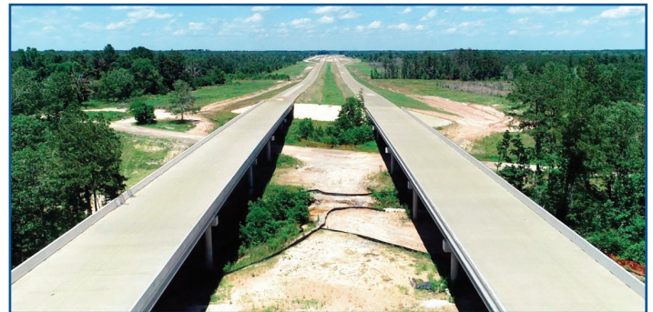
8-mile-long I-69 Diboll Relief Route south of Lufkin was completed to interstate highway standards in the fall of 2025.