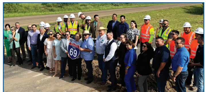
Kickoff of a series of projects to extend I-69 across Kenedy County ranchlands in South Texas.