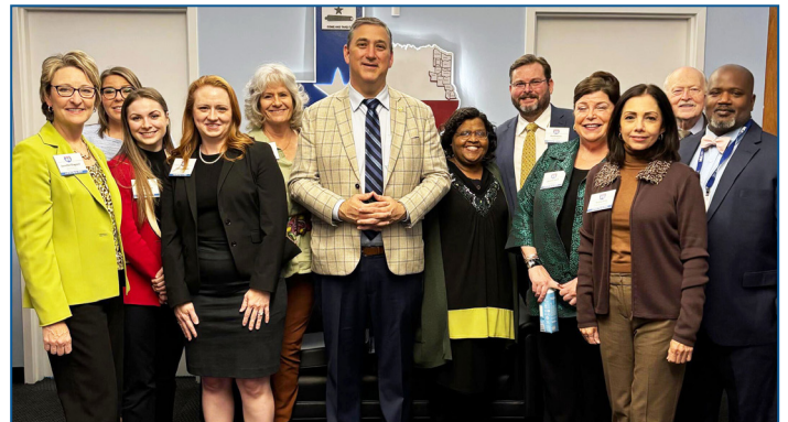
Part of the I-69 delegation meets with Congressman Nathaniel Moran of Longview whose district includes 135 miles of the I-69 System route in East Texas.

LEADERS HIGHLIGHT I-69 IN DC – I-69 Alliance leaders were joined by representatives from several I-69 corridor states to participate in the annual I-69 DC Fly-In. The group met with congressional members and staff in March to discuss funding for I-69 projects through the appropriations process, as well as to explore ways to secure greater federal support of I-69 development through the next federal surface transportation authorization bill. While the current bill expires in September 2026, congressional committees are beginning the process by seeking input from stakeholders and Members of Congress. You can download a copy of our 8-state update HERE .