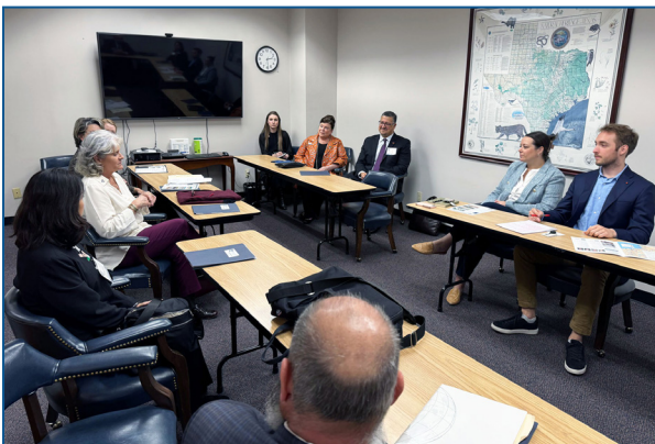
Importance of continued state funding for I-69 was a topic in exchange with Governor's Office staff