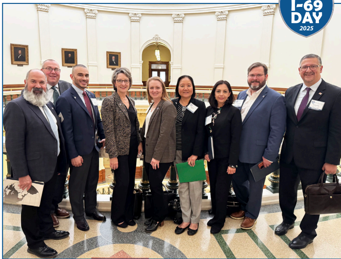
Part of the I-69 delegation making the rounds at the Texas Capitol