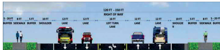
Proposed Roadway Typical Section