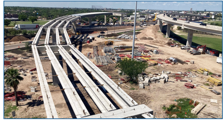
Northbound I-69C direct connect construction in Pharr

interchange project started in 2019 under a design-build contract and is about 75% complete. It includes four direct connectors and freeway widening and realignment. The McAllen to Edinburg connector is expected to open in July and the Harlingen to Edinburg ramp should open later in the year.